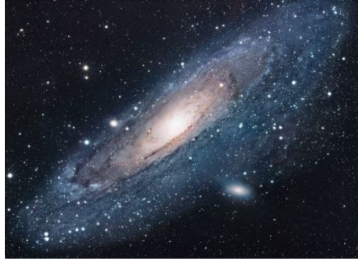
Figure 1. Example of figure